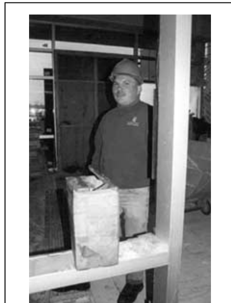
Figure 3. A subcontractor from Lurie Glass installing windows

Every week, Vogel Brothers staff met with subcontractors (Figure 3). These meetings provided opportunities to share information about recycling, answer questions, and address problems. After the DNR grant term began on January 15, 2002, Madison Environmental Group staff attended these meetings and toured the construction site to address workers recycling questions and learn from their experiences. When new materials were generated during the construction process, Vogel Brothers sought Madison Environmental Group’s assistance in investigating its recycling potential.