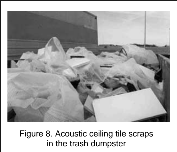
Figure 8. Acoustic ceiling tile scraps in the trash dumpster