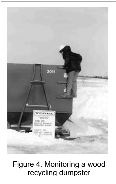
Figure 4. Monitoring a wood recycling dumpster