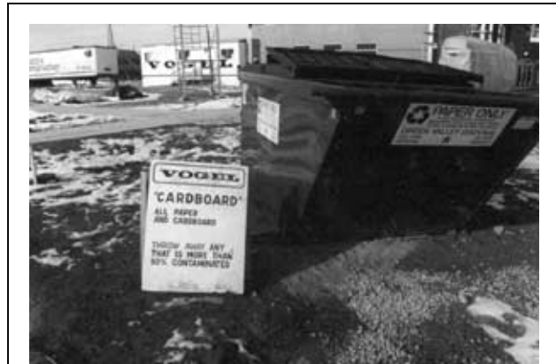
Figure 2. Example of a sign at the cardboard dumpster

Vogel Brothers staff constructed wooden “sandwich board” signs for each of the collection materials: wood, metal, drywall, cardboard, commingled bottles and cans, and trash (Figure 2). Large (12-20 cubic yard) dumpsters were stationed in the building’s parking lot. When a dumpster reached capacity, Vogel Brothers contacted the respective hauler to schedule a pick-up.