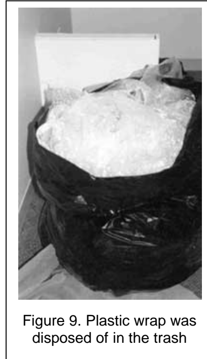
Figure 9. Plastic wrap was disposed of in the trash

There are few limitations to adopting construction waste recycling programs statewide. Disposal expenses at this project suggest that cost is not a barrier to recycling construction waste. Markets for various recyclable materials may vary around the state, however, and lack of a local market may make recycling impractical for a particular material.