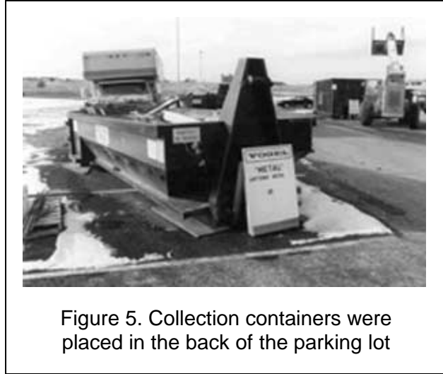
Figure 5. Collection containers were placed in the back of the parking lot

We interviewed construction workers on site to find out what worked well, and what did not. We learned from several people that originally all the dumpsters for recycling and waste were placed in the back of the parking lot rather than adjacent to the construction site. This location was inconvenient for the workers (Figure 5).