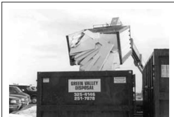
Figure 6. Drywall is dumped from a one-yard dock cart into a 20-yard recycling collection dumpster.

To make it easier to load the containers, one cubic-yard metal dock carts were used to collect recyclable materials adjacent to the building. When these dock carts filled up, the material could then be transferred to the 20-yard dumpsters (Figure 6). This intermediate collection site set up resulted facilitated recycling and waste disposal practices.