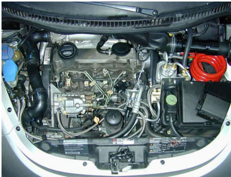
Volkswagon Beetle TDI with Frybrid conversion

In order to effectively use straight vegetable oil fuel in a diesel vehicle, some minor mechanical adjustments must be made to the engine, using a conversion kit. Picture your restaurant’s fryer oil after it is removed from the fryer and cooled. Because it is thick and viscous, that oil must first be heated to 160-180 degrees Fahrenheit in order to work in the engine. Otherwise, it would gum up your car’s hoses and cylinders. Diesel or biodiesel fuel is necessary to start the engine and heat the vegetable oil until it becomes liquid (normally just a few minutes), at which point the engine will switch over to running on vegetable oil. Also, before turning off the engine, it must run on diesel or biodiesel for a few seconds to purge any remaining vegetable oil which would thicken when it cooled.