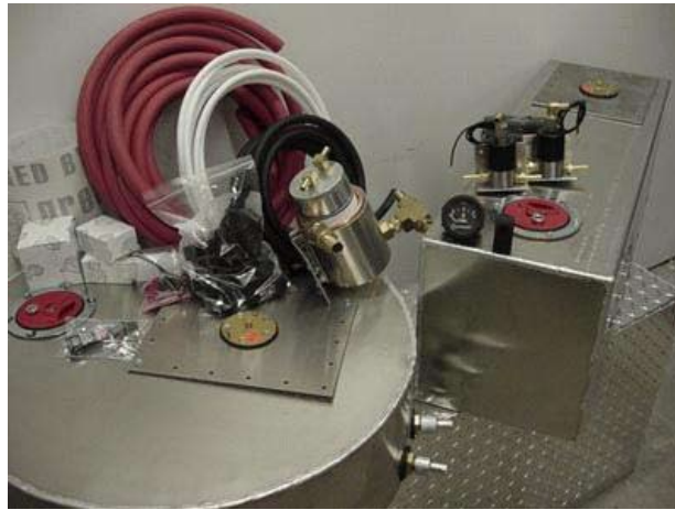
Greasecar conversion kit

The German company Elsbett Technologie has been investigating vegetable oil as an alternative fuel since the 1970s. Their single tank conversion kit includes custom injector nozzles that increase injection pressure, stronger glow-plugs, and a system to pre-heat the fuel. Once converted, you can put any combination of vegetable oil, biodiesel, and diesel directly into the fuel tank and you do not need to worry about switching from one fuel to another. The engine starts easily and burns cleanly from the start, even in cold temperatures. However, installing the Elsbett kit requires more engine modification than is necessary for the dual tank kits.