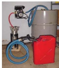
Stationary filtration system

Note: Whatever option you choose, take care to avoid pumping oil from the bottom of the storage container, where food particles and water settle. Particles and water can potentially damage the vehicle engine.