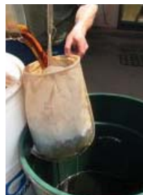
As needed filtering